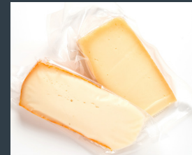
Bags MAP, Long-hold, Short-hold